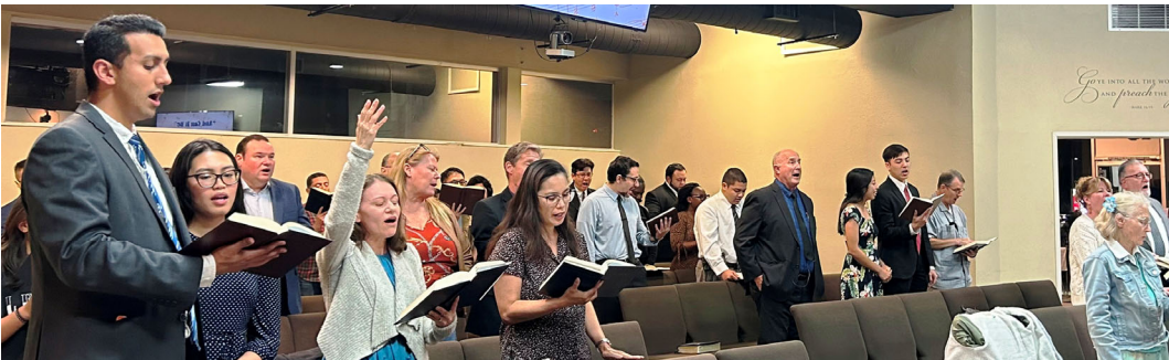
Spirited congregational singing!